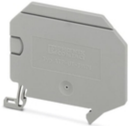
Partition plate, length: 62.1 mm, width: 2.2 mm, height: 52.5 mm, color: gray

Please be informed that the data shown in this PDF Document is generated from our Online Catalog. Please find the complete data in the user's documentation. Our General Terms of Use for Downloads are valid ( http://phoenixcontact.com/download )